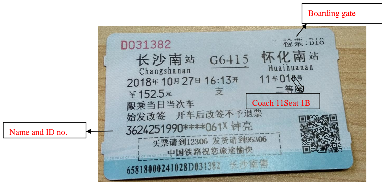
High speed train ticket information